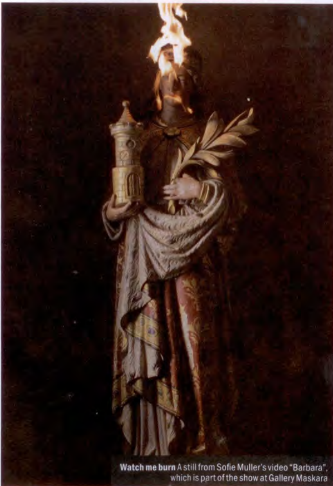
Watch me burn A still from Sophie Muller's video "Barbara", which is part of the show at Gallery Maskara

MMRDA Grounds, BKC Road, Bandra Kurla Complex, Bandra East (2659-4102). Bandra (WR, CR Harbour). National Stock Exchange. Wed Nov 28-Sun Dec 2. Public hours (Thur Nov 29-Sun Dec 2) 11.30am-8pm; last entry at 7.30pm.