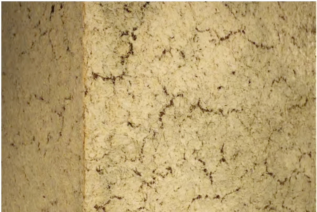
Yellow, 2012 Detail