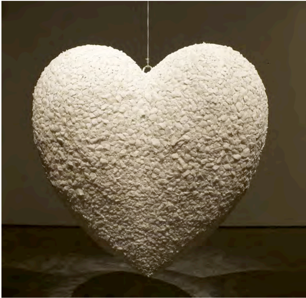
Love, 2012 Marble blast-stones 60 x 60 x 24 inches