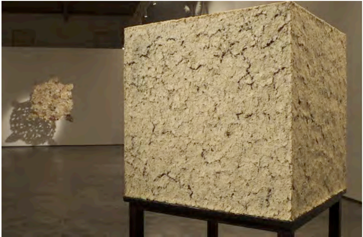
Yellow, 2012 Sweet lime bagasse, wood, metal 36 x 36 x 36 inches